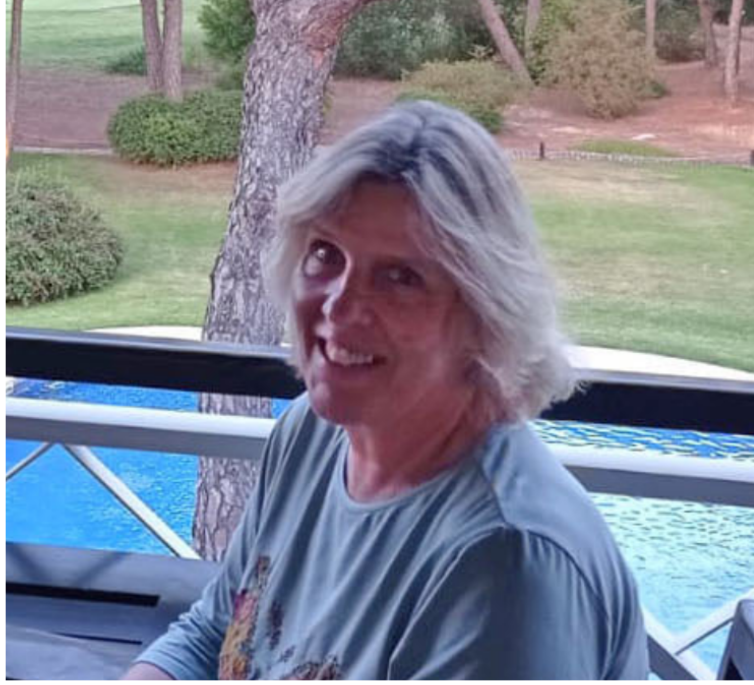
Serendip Properties (Serendip Properties)

Phone: +34 650 965 677 Website: https://serendipproperties.com