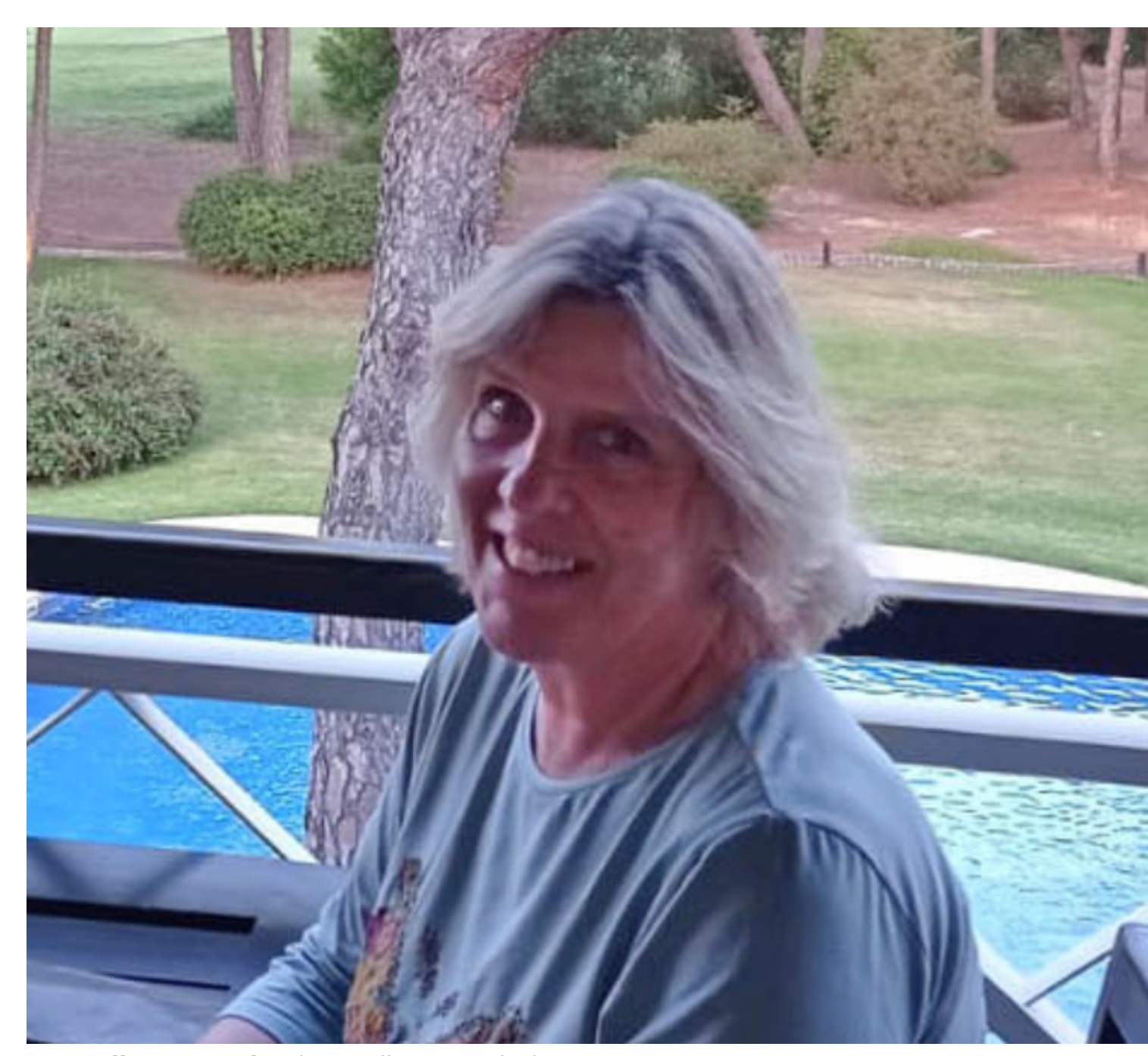
Serendip Properties (Serendip Properties)